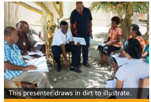
This presenter draws in dirt to illustrate.