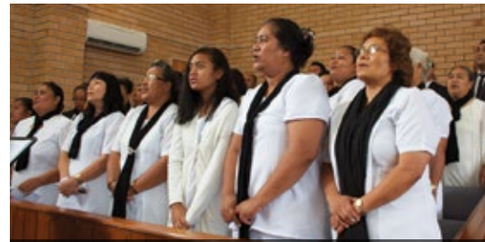
A new church planted in Liverpool, NSW, recently.

For more information, visit <record.net.au>.