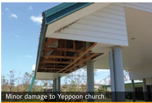
Minor damage to Yeppoon church.