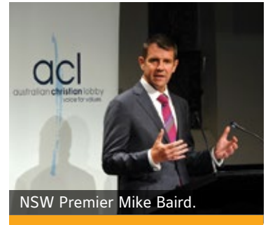
NSW Premier Mike Baird.