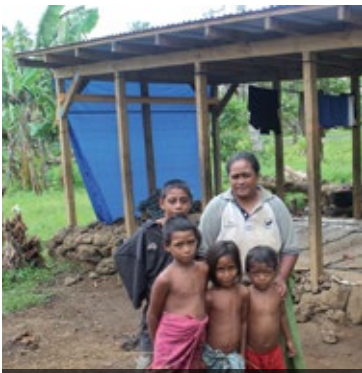
A family with one of the shelters.