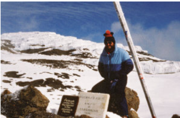
The climb to the top of Mount Kilimanjaro, at 19,341 feet,