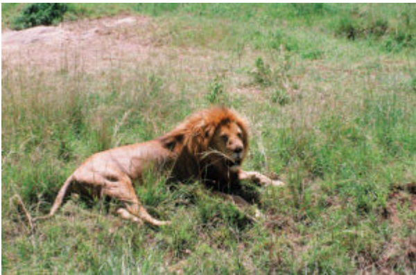
Not an unusual site in Kenya, this lion is relaxing so near the roadside that no telephoto lens is needed!

await the time I will ever be with Jesus in heaven. While reading your article, I just giggled, even laughed, seeing the eternal joy I will have one day.... You put it in such a way that just brought joy and a big smile on a lonely prisoner's face!"